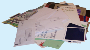
junk mail, flyers, brochures