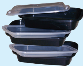
takeout plastic food containers (rinsed)