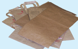
brown paper bags