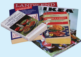
soft cover books & catalogs