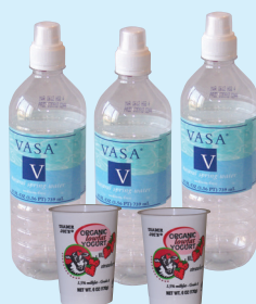
empty plastic containers