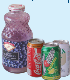
empty cans, glass bottles & jars