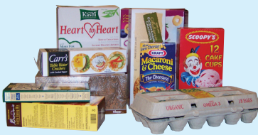
cartons & frozen food packaging