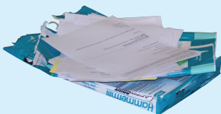
copy paper & ream wrappers