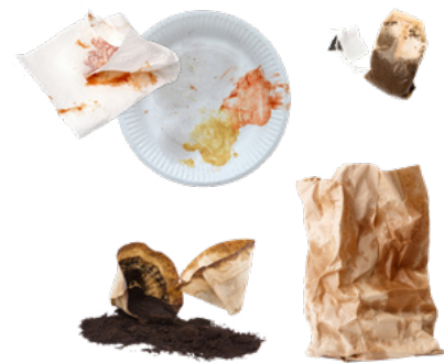
Food-Soiled Paper & Paper Bags