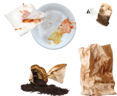
Food-Soiled Paper & Paper Bags