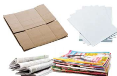
Cardboard, newspaper, paper and magazines